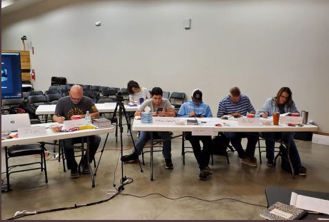
25 on-site students and 7 online students joined in for a 1.5 day workshop for How to Study the Bible.